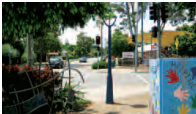
Oxley Road and Clewley Street Intersection, Corinda.

Early works, including service relocations, are currently underway. The main construction period is scheduled to start in early 2012, to avoid disruption to local businesses over the Christmas period, and will take six months to complete, weather permitting.